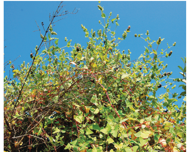
Seed-laden mile-a-minute vines completely cover trees beneath.